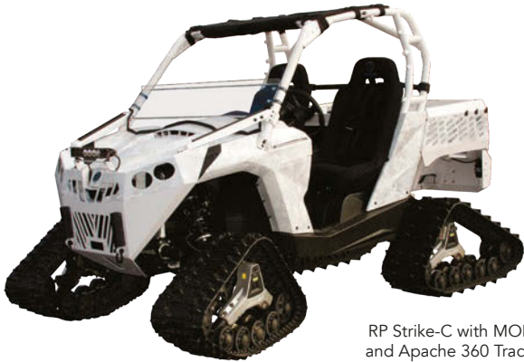
RP Strike-C with MOLLE Roof and Apache 360 Track System